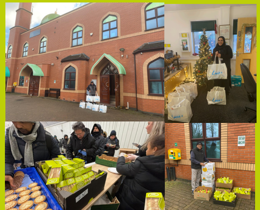
Donations recieved and distributed via collaborative efforts between Masjid Al Falah and PACT