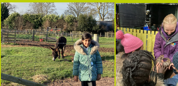
Slimbridge and Lower Drayton Farm trip, Cost free for children to attend.