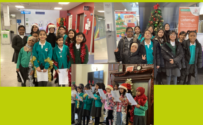
PACT children offering community service by singing at Heartlands Hospital, Hodgehill Grange Care Home and St. Peter's Housing Trust